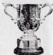
League Cup Winners 1965

CLUB COLOURS: Shirts: Royal Blue. Shorts: Royal Blue. Stockings: White.