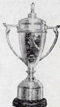
F.A. Youth Cup Winners 1960, 1961

REGISTERED ADDRESS: STAMFORD BRIDGE GROUNDS, FULHAM ROAD, LONDON S.W.6, (FUL 5545)