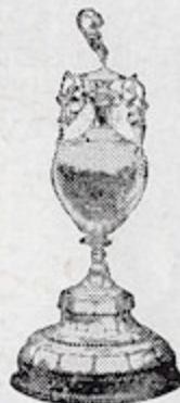
League Champions 1955