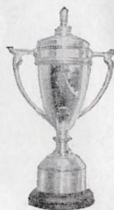
F.A. Youth Cup 1960 and 1961