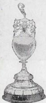
League Champions 1955