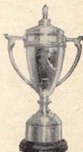
F.A. Youth Cup 1960 and 1961