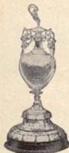
League Champions 1955