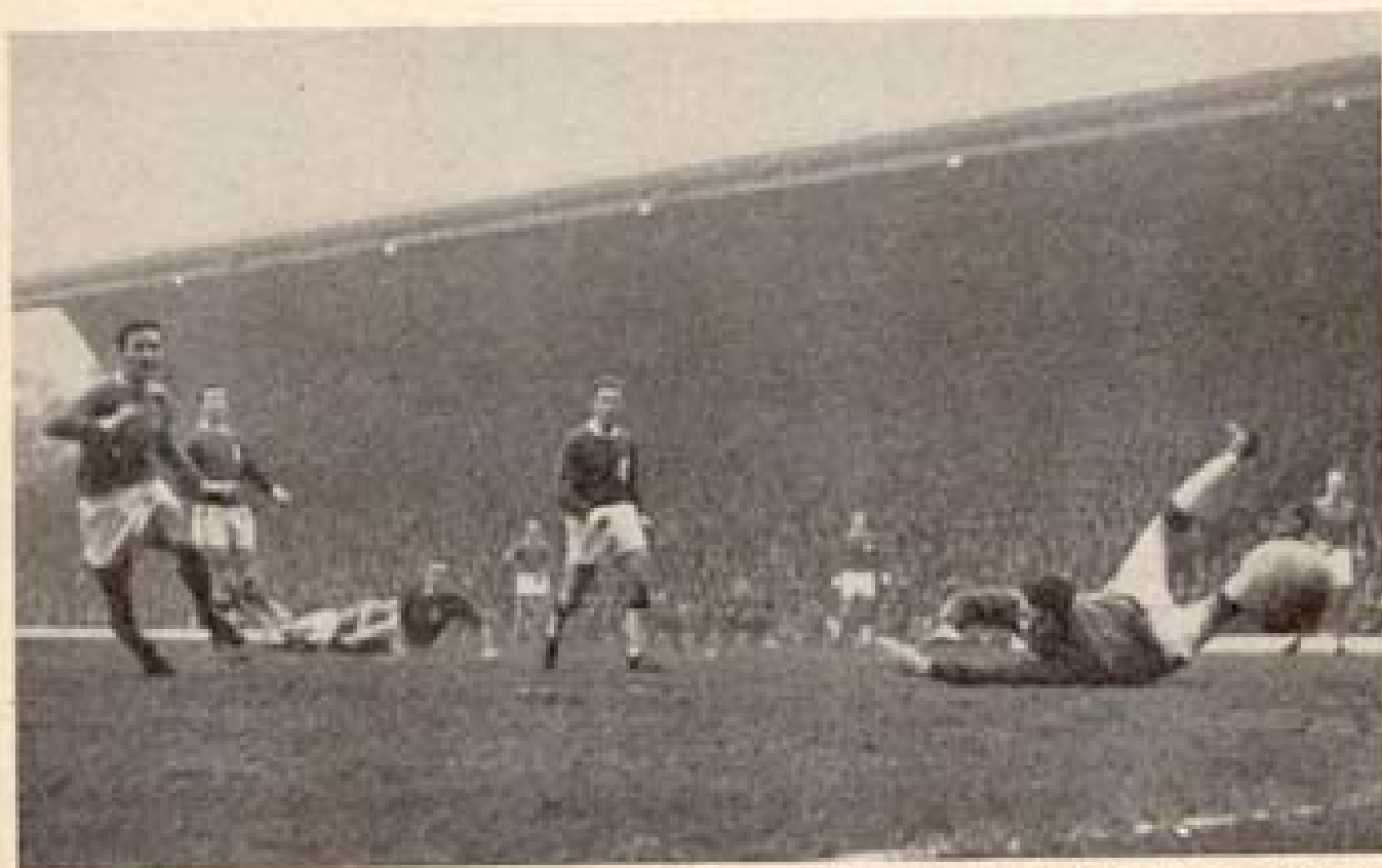
Nearly another. Bobby Tumbling's shot beats Liverpool 'keeper Lawrence, but goes just outside.