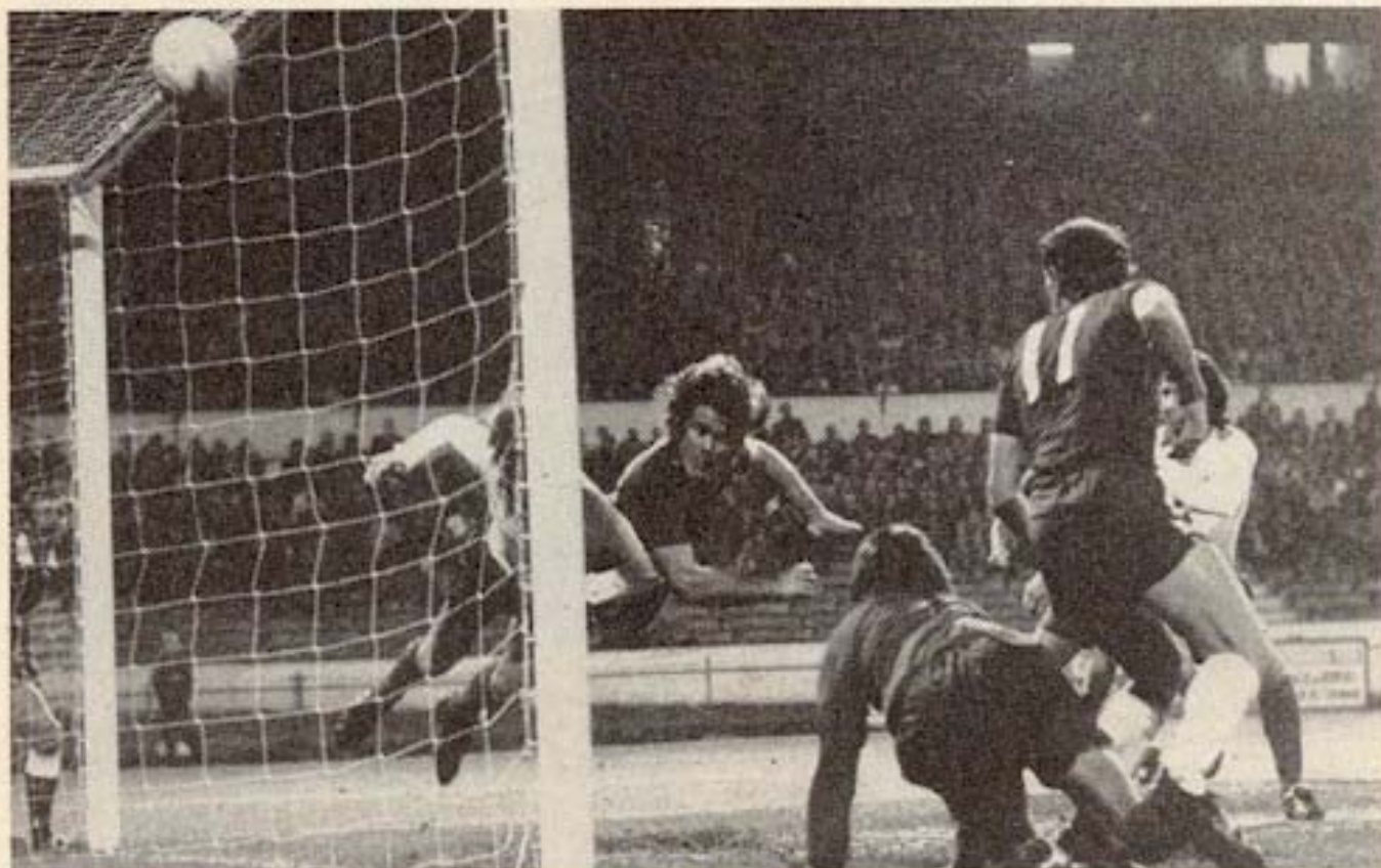
On the front cover we show the photograph of Peter Osgood's winning goal against Derby here on Monday. On page five we feature the first goal of the night by Steve Kember . . . and, to complete the picture-story of a memorable Chelsea win, here's the "one in the middle", our second, headed by DAVID WEBB from John Boyle's corner and an assisting header by Marvin Hinton. Peter Houseman has a near-post view, and likes what he sees. Didn't we all!