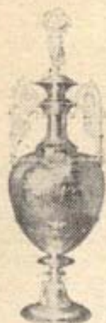
League Champions 1955