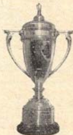
F.A. Youth Cup Winners 1960, 1961

REGISTERED ADDRESS: STAMFORD BRIDGE GROUNDS, FULHAM ROAD, LONDON S.W.6. (FUL 5545)