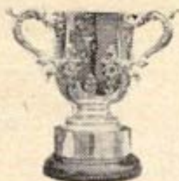
League Cup Winners 1965

CLUB COLOURS: Shirts: Royal Blue. Shorts: Royal Blue. Stockings: White.