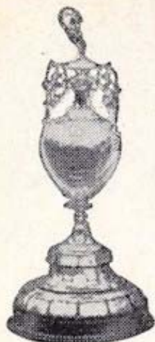
League Champions 1955