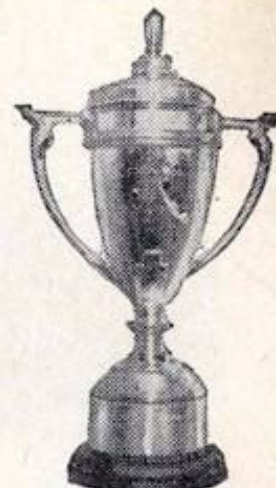
F.A. Youth Cup 1960 and 1961