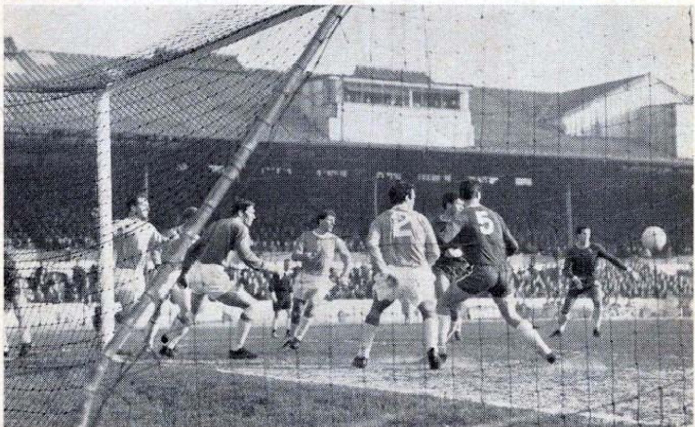
John Mortimore is right "in the picture" for this corner. As in the picture opposite, Blackpool's goalmouth is packed . . . again the ball was cleared.